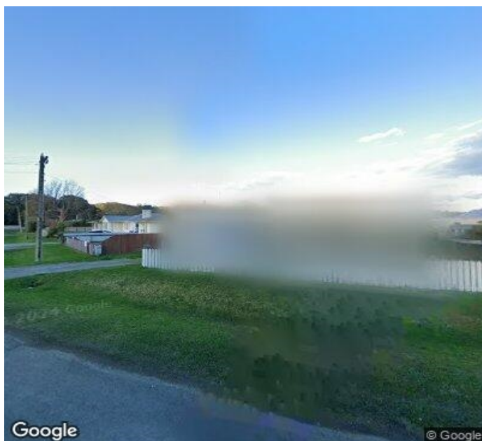
Google Streetview Image

Information on this plan is indicative only and not mapped to a survey accurate scale. Gisborne District Council accepts no liability for its accuracy and it is your responsibility to ensure that the data contained herein is appropriate and applicable to the end use intended. The information included in this report is indicative only and does not purport to be a complete database of all information in Gisborne District Council's possession or control. Gisborne District Council shall not be liable for any loss, damage, cost or expense (whether direct or indirect) arising from reliance upon or use of any information provided, or Council's failure to provide this report. Copyright under Creative Commons Attribution 4.0 International licence. May contain data sourced from the LINZ Data Service, BOPLASS or Gisborne District Council. For more detailed information relating to this property please request a Land Information Memorandum report from Gisborne District Council - http://www.gdc.govt.nz/land-information-memorandum-lim/